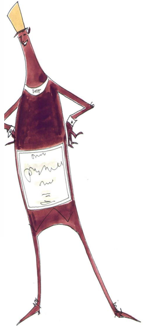
Smooth and approachable