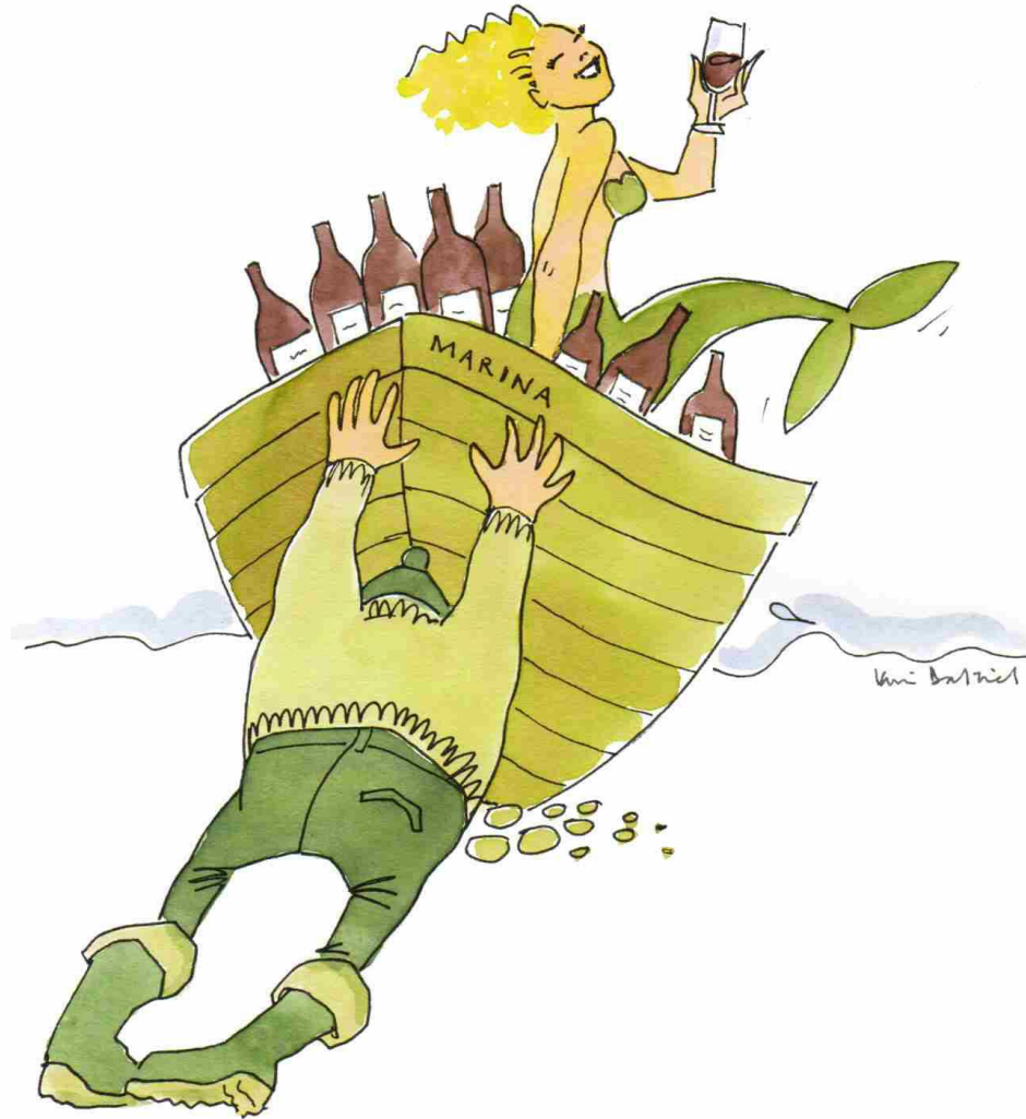
Pushing the boat out